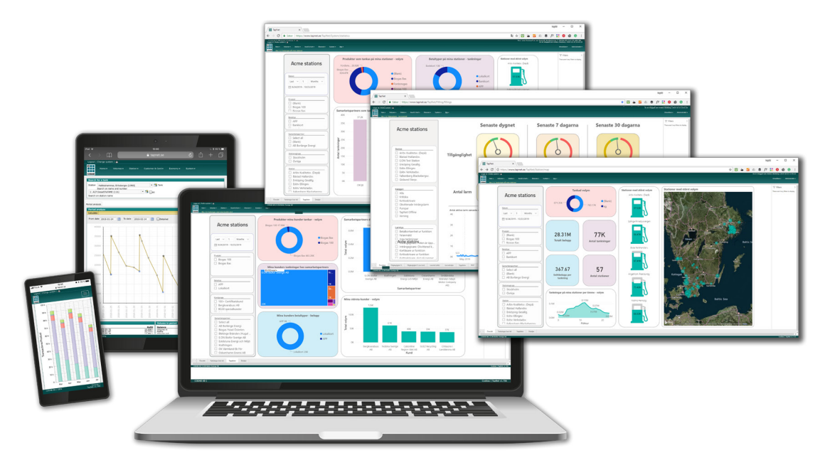
TapNet Analytics allows you to visualize and explore all available information about your station network.

You get access to fuel levels in each tank and compatment in real-time and reports of historical sales variations simplifies the planning of fuel deliveries and tank refills.